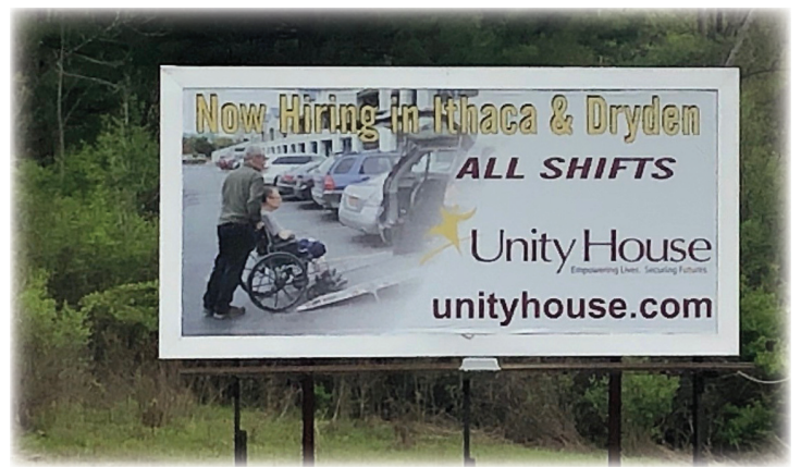
Drive by and check out our new billboard! It is located on Route 13 near Dryden.