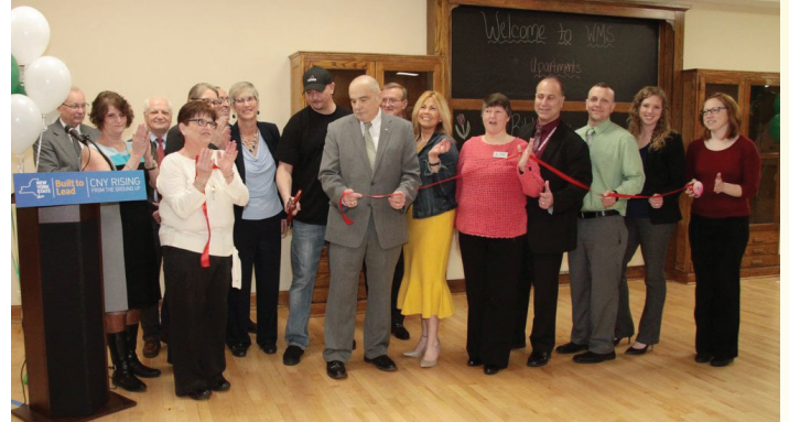
Dignitaries cutting the ribbon at the official opening of WMS Apartments on April 16, 2018

It's hard to believe, but Unity House moved its headquarters into the former West Middle School three years ago. The agency partnered with Two Plus Four Construction in East Syracuse to turn the empty school building into 59 affordable apartments and our organization's headquarters. This project met a huge housing need in Auburn.