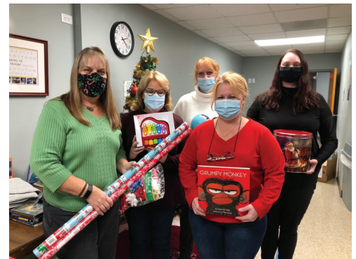
Staff at headquarters adopted an Auburn family.