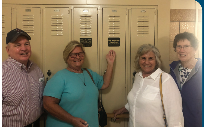
Members of the West High School class of 1961 with their plaque

Email development@unityhouse.com or call 315-253-6227 x313 for details and to order. What a great way to support Unity House and be remembered in your alma matter forever!